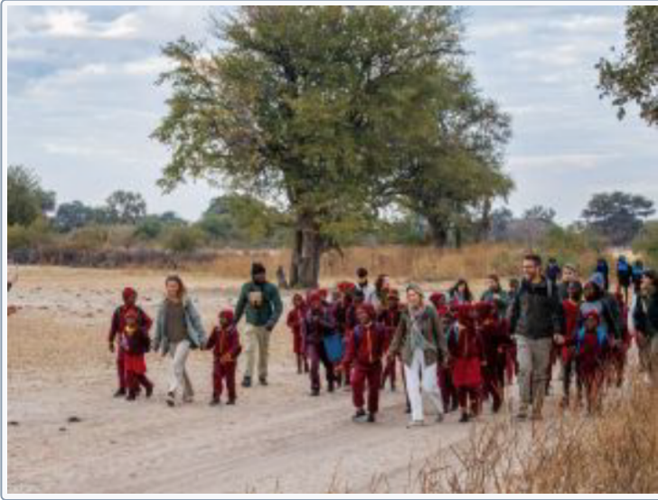
village life in rural Matabeleland.